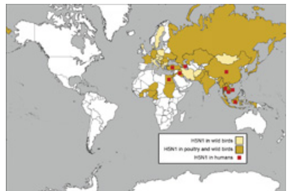
Nations with Confirmed Cases H5N1 Avian Influenza (April 27, 2006)