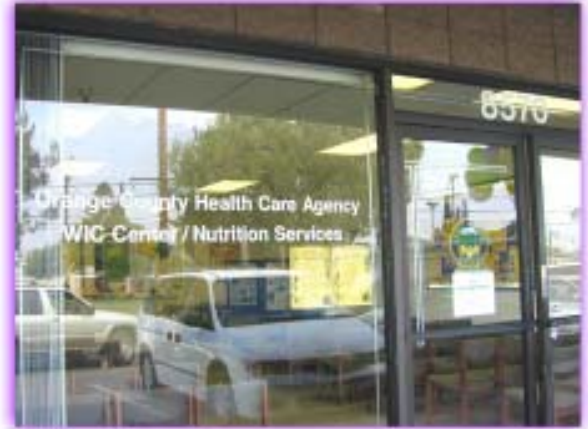
The Fountain Valley WIC Clinic celebrated its grand opening in October 2003 and has since served many of its clients at this convenient and easily accessible location.

Nutrition Services provides nutrition education, breastfeeding support and supplemental food vouchers to women who are pregnant, breastfeeding and/or postpartum, or have infants and children up to 5 years of age. Below is a listing of HCA's WIC and Family Resource Center locations throughout the County where clients are served. Client referrals to WIC clinics are always welcome. For more information about the WIC program or to schedule an appointment, call (714) 834-8333 or visit www.ochealthinfo.com/public/nutrition/wic.htm .