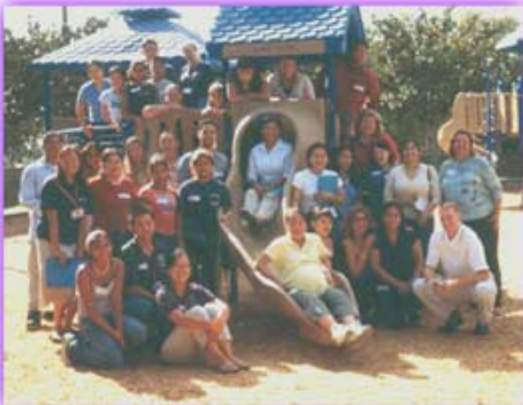
Members from TUPP’s “Back That Ash Up!” Youth Coalition took a moment to pose for a group photo at Olive Park in Orange during their August 2003 kick-off meeting.

834-5710 or Sherryl Ramos at (714) 834-2909 from TUPP or visit www.ochealthinfo.com/tupp .