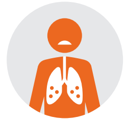
Severe illness (sickness)