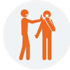
Close contact with people, such as touching or shaking hands