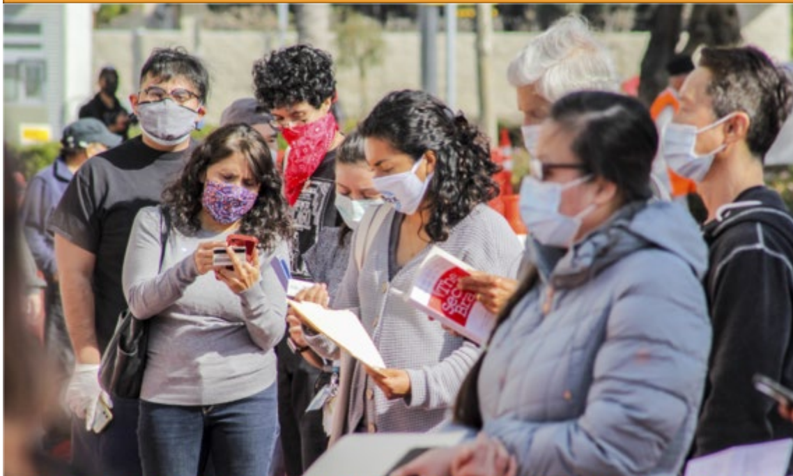
The Santa Ana College Community POD serves to vaccinate eligible residents in targeted communities highly impacted by cases of COVID-19.