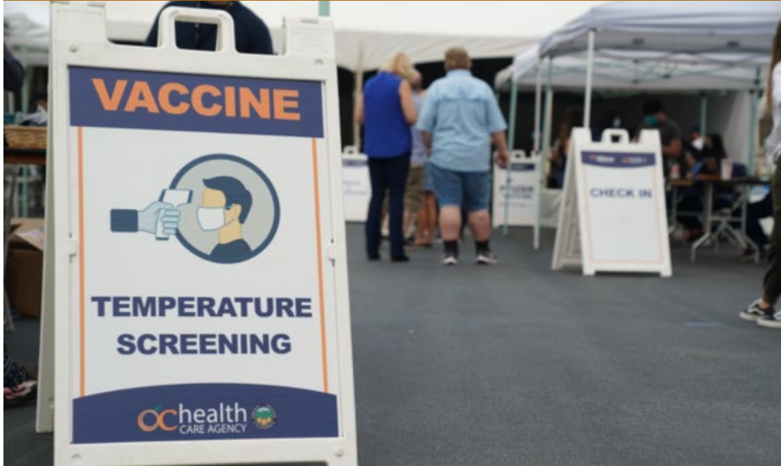
Community members get their temperatures checked before being vaccinated against COVID-19 at a mobile point-of-dispensing event sponsored by CalOptima and the County.