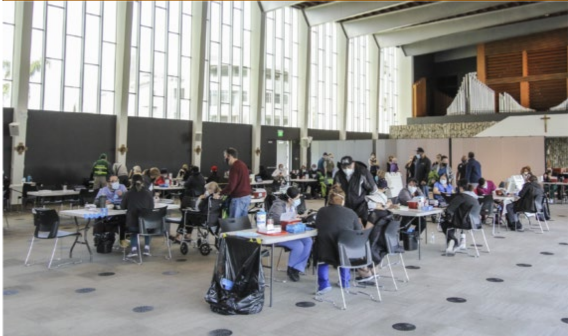
Community members receive COVID-19 vaccinations at the Christ Cathedral Community Point of Dispensing (POD) in Garden Grove.