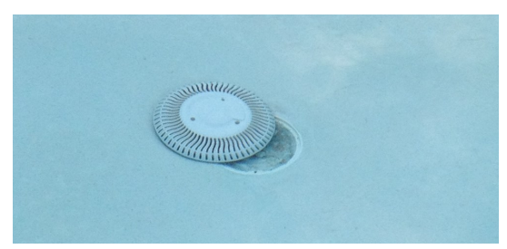
Figure 2: Drain cover that is loose.