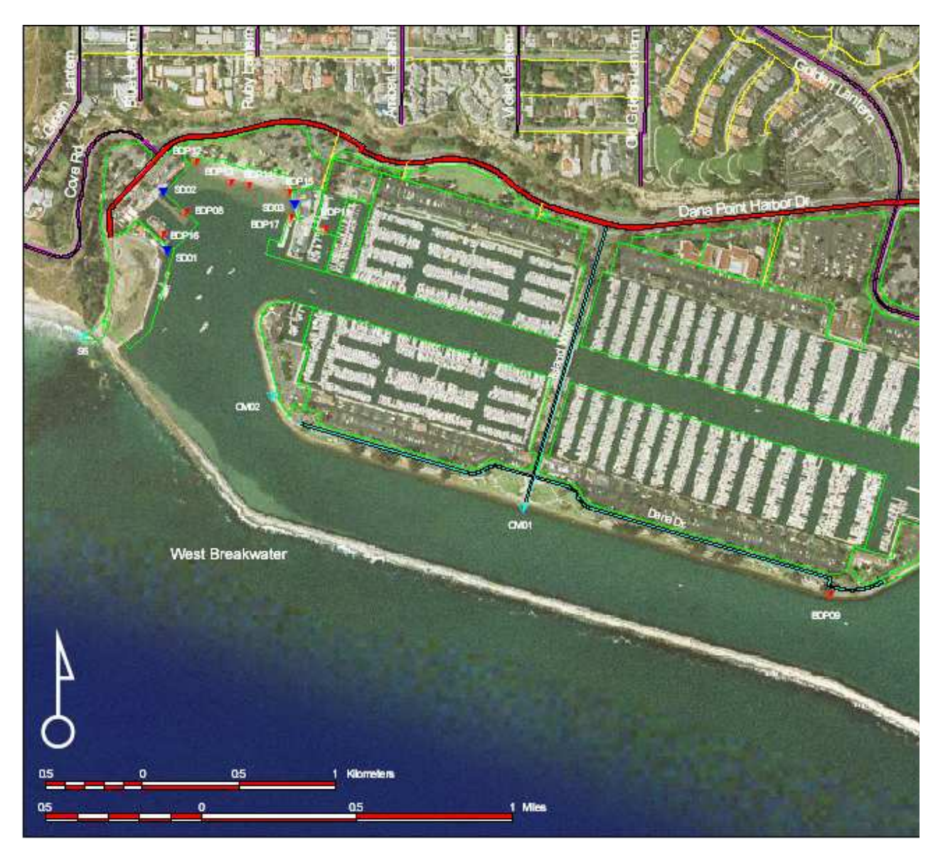
Figure 1-1: Baby Beach Site Map