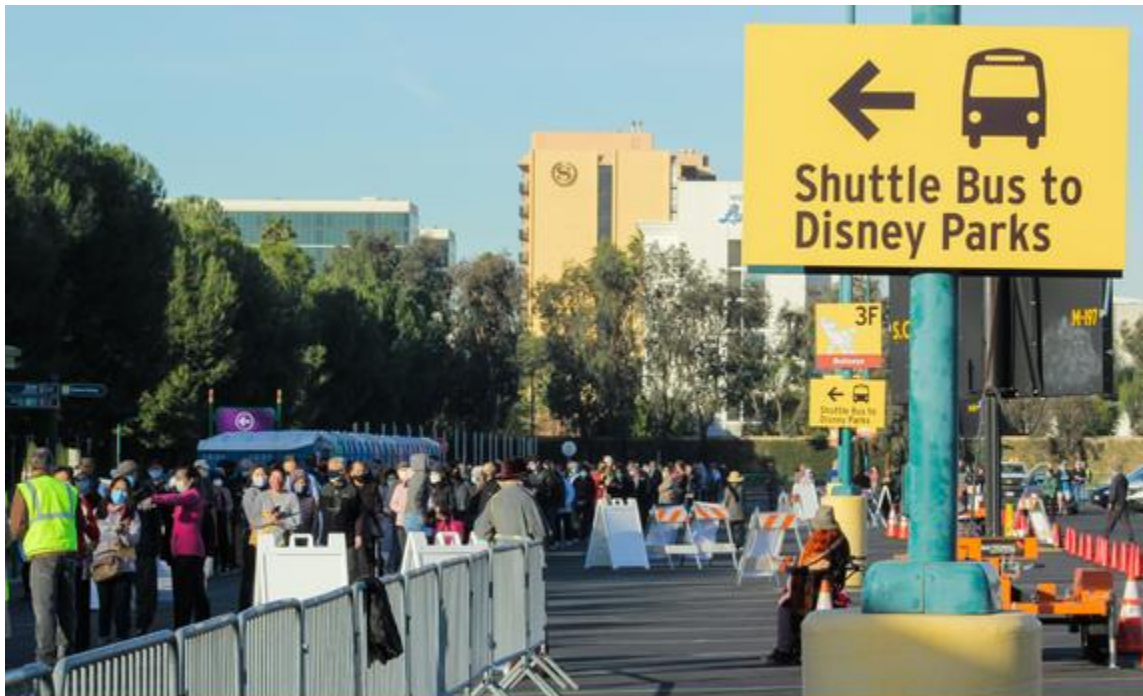
Pictured: OC residents getting their COVID-19 vaccination at the Disneyland Super POD site