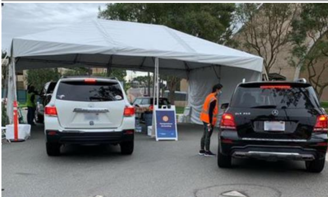
Pictured: In-car vaccinations are now available for eligible individuals with disabilities who have appointments at the Soka University Super POD site