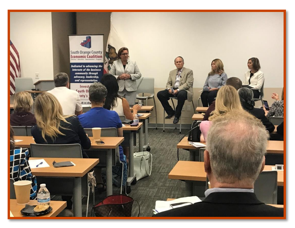
OC Business Council, Building Industry Association of Orange County, Orange

County Association of Realtors and local city Chambers of Commerce.