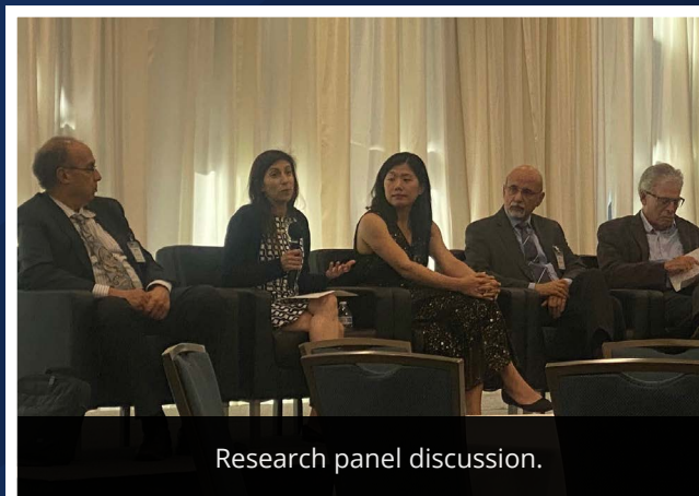
Research panel discussion.